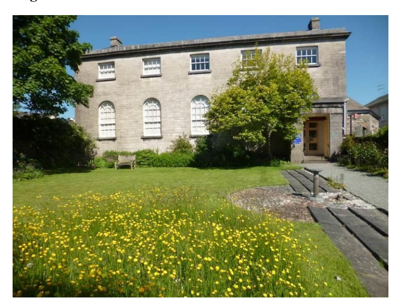
Fig.7: burial ground from the east

The burial ground is recorded as being on both sides of the meeting house; the north side is now a car park and the south burial ground is maintained as a garden with a lawn, flower borders and trees. Burial records are kept in the meeting house strong room; the burials predate the 1818 meeting house, and range in date from c1687 to c1840. Some memorial stones are laid flat along the east side of the lawn. The south burial garden is enclosed by drystone walls to the west and east with a dwarf wall of dressed stone, copings and corner piers to the south; originally this had iron railings, but these were removed (probably in the war) and replaced with steel railings in the post-war period. A large magnolia grows against the south side of the meeting house. Meadow saxifrage unusually grows in the lawn, and Friends take advice from Cumbria Wildlife Trust on an appropriate grass mowing regime.