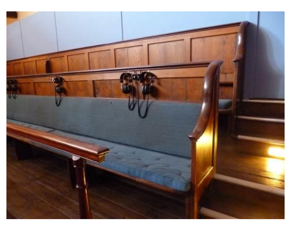
Fig.3: former ministers' stand