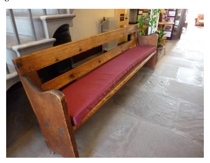
Fig.6: pine bench in entrance lobby