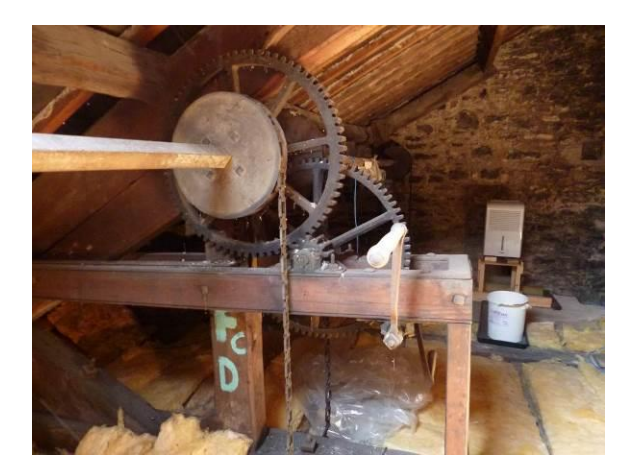
Fig.4: Lifting gear in the roof