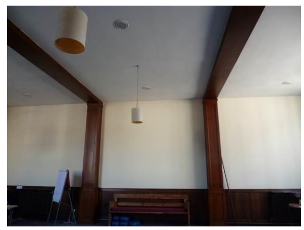
Fig.5: meeting room on north side

In the roof space above the meeting rooms the original winding gear to raise the shuttered partitions is in situ (Fig.4). The 4-bay roof has king post trusses with raking struts and two tiers of purlins.