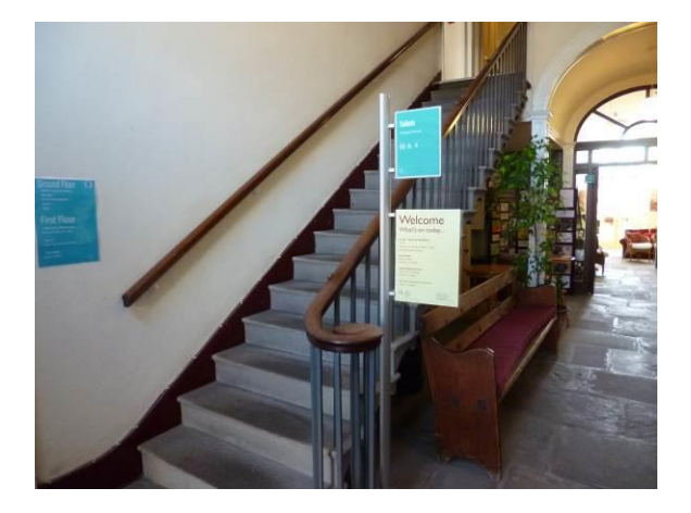
Fig.2: one of a pair of staircases